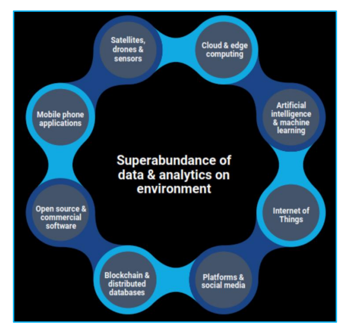
Figure 3 Schematic of digital technologies ecosystem for environmental application<sup>16</sup>.

Scotland is exceptionally well-placed to harness the potential generated by emerging digital technologies related to big data geographical analysis, cloud-based computing and remote sensing and earth observation (EO). This is evidenced by the significant expertise in geospatial and EO analysis that exists within the public and private sectors and Scottish academic and research institutions and the plethora of high-quality and innovative spatial datasets and web mapping applications that have been produced in Scotland.